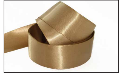
Gold Leaf 160

Widths with extended lead times Approx 2-3 weeks 12mm, 20mm.