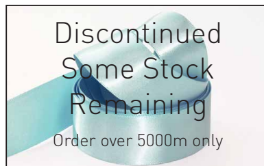
Angel Blue 705

Check with Customer Service for Availability