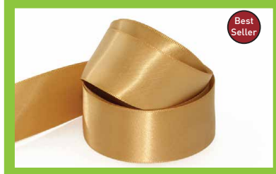
Sand Dune 150

Available in 5mm, 7mm, 10mm, 15mm 25mm, 38mm, 50mm.