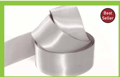
Silver Coin 920

Available in 5mm, 7mm, 10mm, 15mm 25mm, 38mm, 50mm.