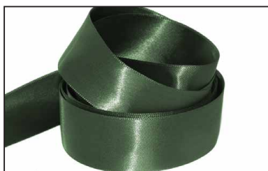
Village Green 750

Item can be dyed to order MOQ 5,000 Metres