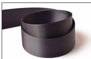
Dark Grey 970

Widths with extended lead times Approx 4-5 weeks 5mm, 7mm, 12mm 20mm, 38mm, 50mm.