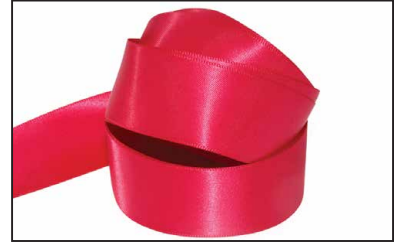
Paris Pink 470

Widths with extended lead times Approx 2-3 weeks 12mm, 20mm.