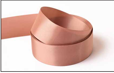
Rose Gold 330