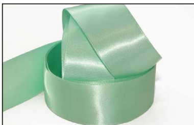
Eau De Nil 720

Widths with extended lead times Approx 4-5 weeks 5mm, 7mm, 12mm 20mm, 38mm, 50mm.